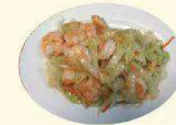
Shrimp Chow Mein