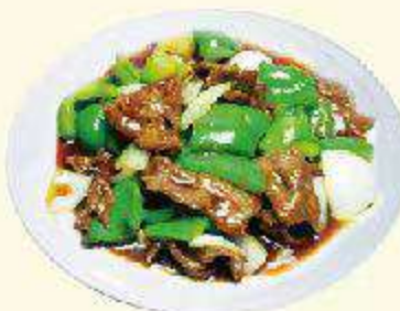
Pepper Steak with Onion