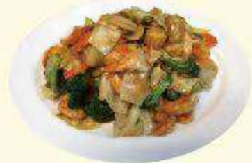
Shrimp w. Mixed Vegetable