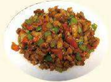
Chicken with Cashew Nuts