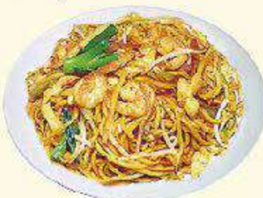
Shrimp Lo Mein