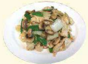
Moo Goo Gai Pan

All Served with Pork Fried Rice and Soda