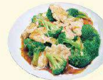
Chicken w. Broccoli