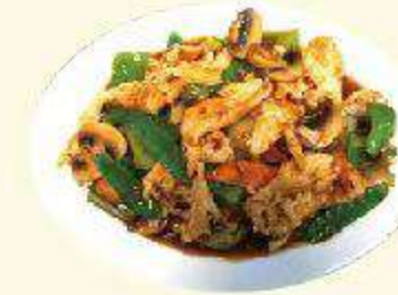
Chicken in Garlic Sauce