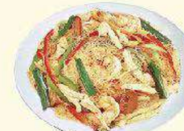
Singapore Mei Fun