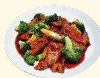
Pork w. Broccoli